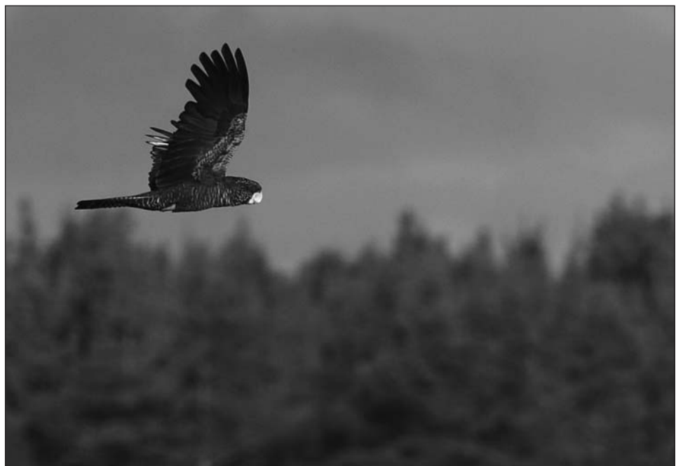
Wayne Bigg (Mt Gambier) has sent in some brilliant snaps of Red-tails he photographed at Wandilo Forest reserve. Visit the photo gallery on www.redtail.com.au to view.

Red-tailed Black-Cockatoo & Buloke Woodland